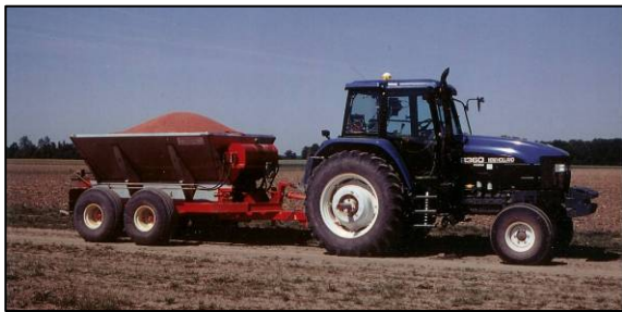
A Chandler spinner spreader with a Mid-Tech controller is used to apply variable rate lime.

To keep field history data, generate plot plans, and implement field treatments the commercially-available software SMS TM Advanced, ArcView, and Farm Works ® are utilized. This geographic information system (GIS) software allows users to store, retrieve, adapt, and manipulate site-specific data from fields. For instance, crop yields or moisture can be correlated with other information collected in the field, such as soil mapping unit or drainage information. High-speed data transmission lines allow for rapid transfer of information to end users on campus or around the state.