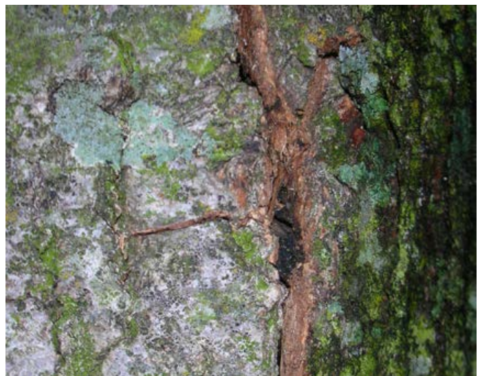
Figure 4. Pressure pads develop under the bark of infected red oaks.