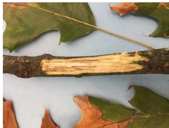
Figure 1. These branches and leaves show symptoms of oak wilt.