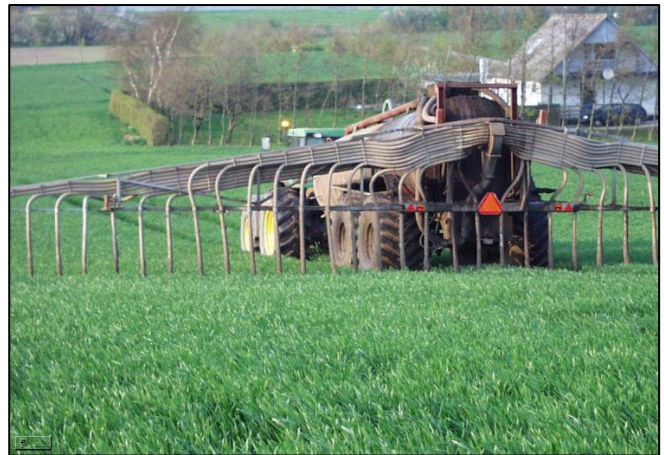
Danish farmers must comply with strict nitrogen accounting.

Every farmer in Denmark must submit every year a fertilizer account detailing amounts of animal manures, fertilizers purchased, and the like. The DAAS advisors compared it to submitting an income tax return. The general goal of nitrogen fertilization is that it be 75% efficient—that most of the nitrogen is utilized by the crop, not lost to the environment where it could potentially cause harm. And while a 75% efficiency rate might seem reasonable to a non-agriculturalist, this is a very high expectation compared to the estimated efficiencies that might be expected by a Midwest corn farmer. If a Danish farmer exceeds nitrogen quotas, they are initially fined about $0.50 per pound nitrogen over-applied per acre. Fines are double or more for repeat violations and when applications exceed