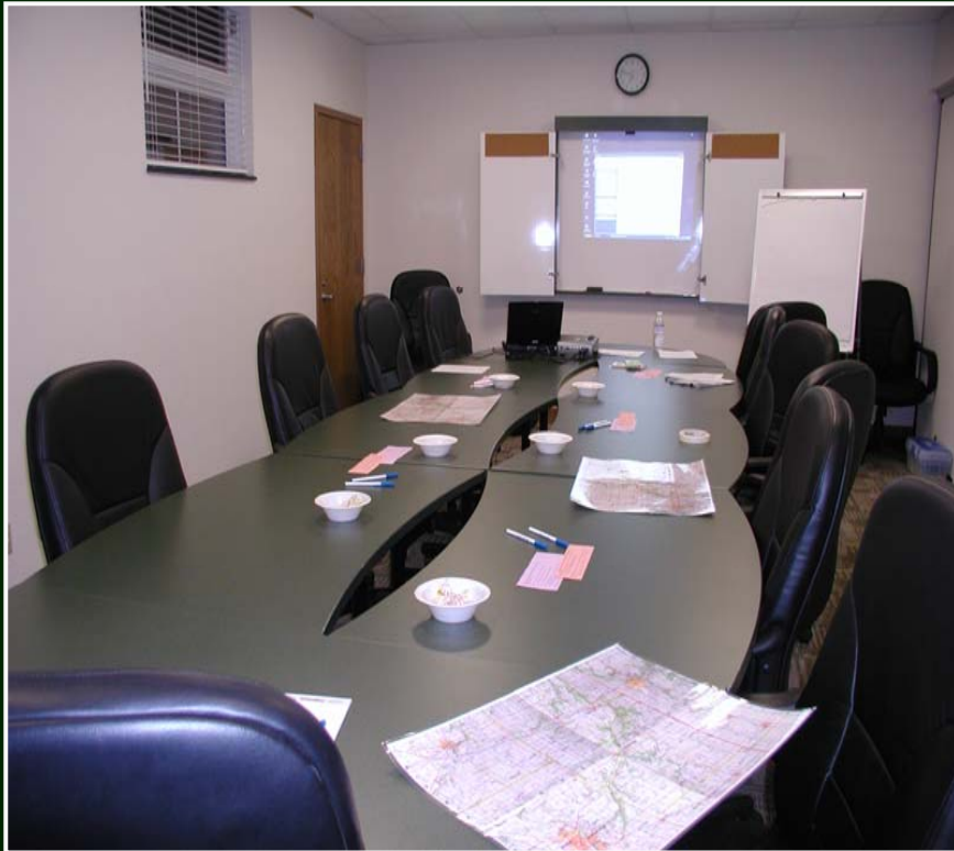
Community # 1