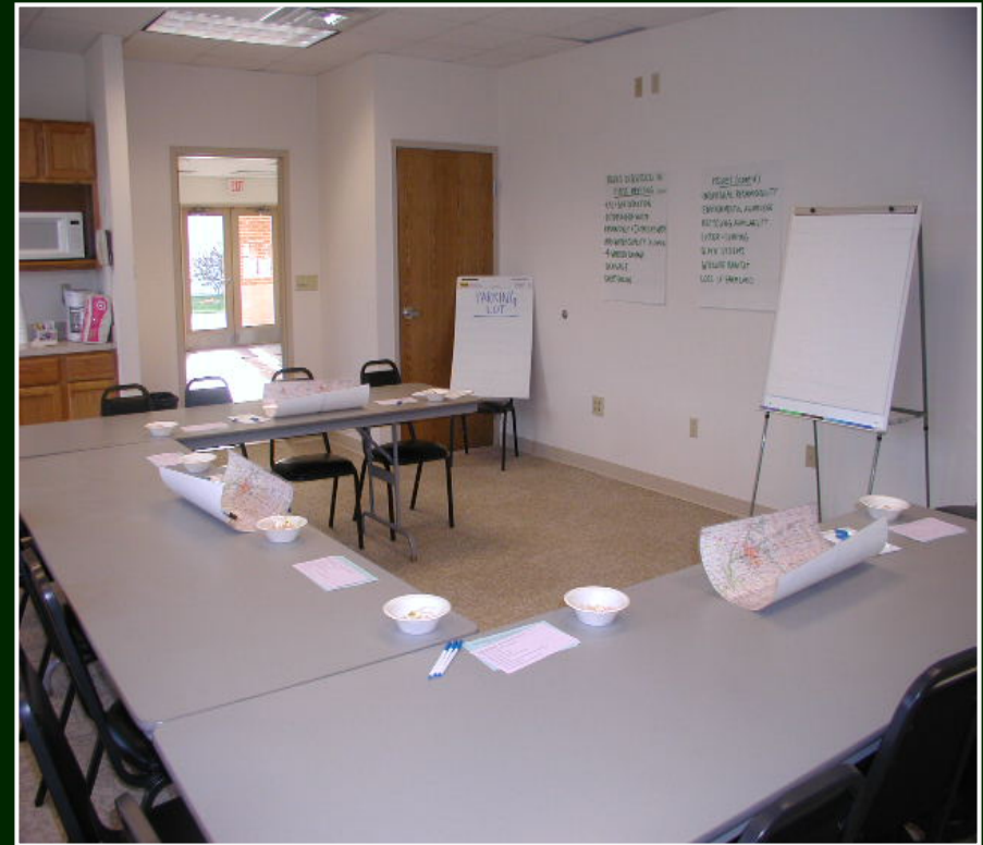
Community # 2