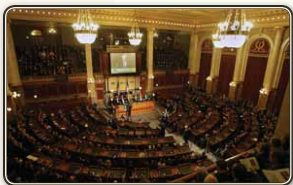
Iowa State Capitol House Chamber during World Food Prize ceremony.